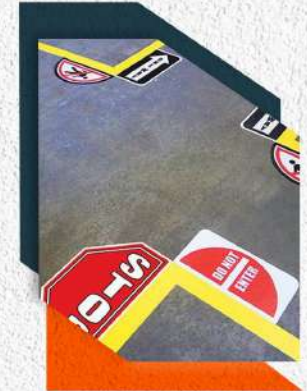
Floor Marking Custom