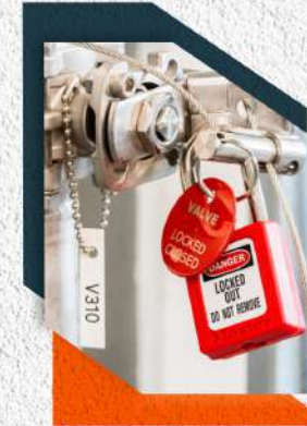
Valve & Nameplate Custom