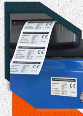
Custom Label Custom