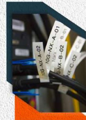
Other Marking Custom