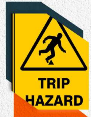
Symbol Sign Custom