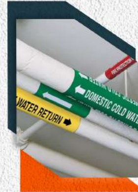
Pipe Markers Custom

We work in close contact with our costumers, we consider them our partners. For any project we assign one team that will relate and work helbow to helbow to them.